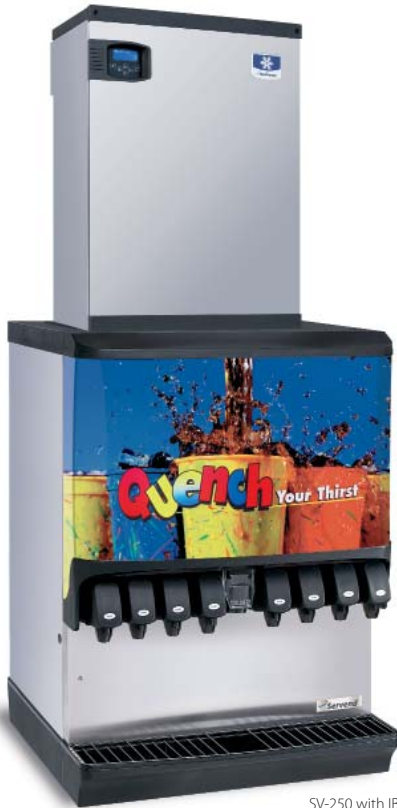
SV-250 with IB1090C Ice Machine